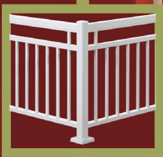
Disponible en double traverse Available as double rail