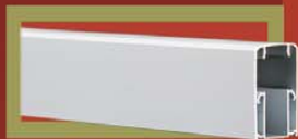
MAIN COURANTE No 0 HANDRAIL 1-1/2" x 3"