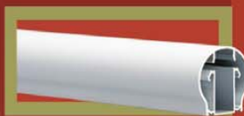
MAIN COURANTE No 3 HANDRAIL 2-1/8" x 2-1/4"