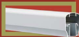
MAIN COURANTE No 7 HANDRAIL 2" x 2-3/4"