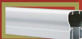
MAIN COURANTE No 8 HANDRAIL 2-1/8" x 3-1/2"